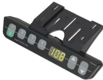
Discontinued version 645-03102

The current display hand switch is undergoing a look refresh for 2022. Functionally, there are no changes for the user operation. The mounting hole locations and visual appearance does change. Inventory of the current switch is available through 2022.