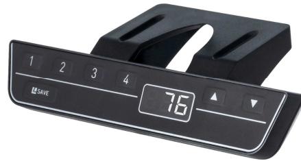
New version 645-03112